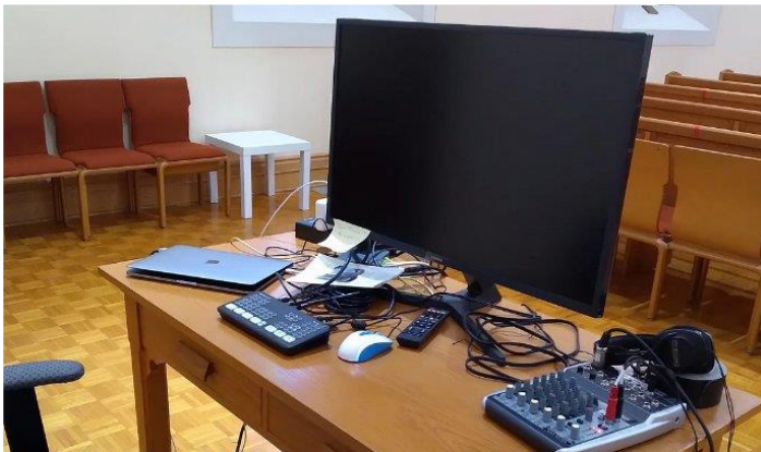
Our A/V Centre

The AV Centre is all housed on a small table at the back of the church with the exception of a camera, which is mounted higher on a centre pillar. The camera is capable of wide shots, zooming in, panning from side to side and tilting up and down, controlled by a single 'joystick'.