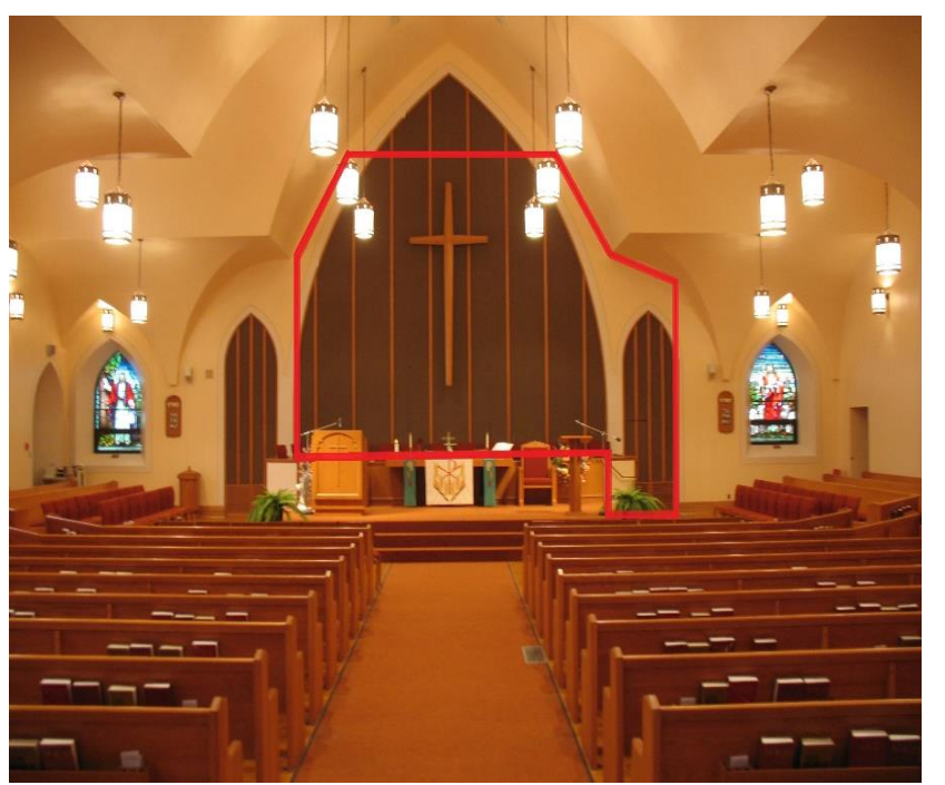
Grace United Church c. 2012

(SEVENTY-SEVEN THOUSAND, FOUR HUNDRED & TWENTY-FIVE CANADIAN DOLLARS)