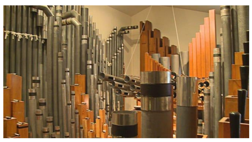
The pipes inside an organ chamber

This chamber is enclosed by shutters which may be opened or closed by a pedal at the console to affect the volume. There are 964 pipes in this chamber and it is the largest division of the organ. The Great (middle keyboard) pipes are above located the Swell chamber on the left side and total 671 in number. The Positiv (lower keyboard) pipes, of which there are 549, are above the Swell on the right side.