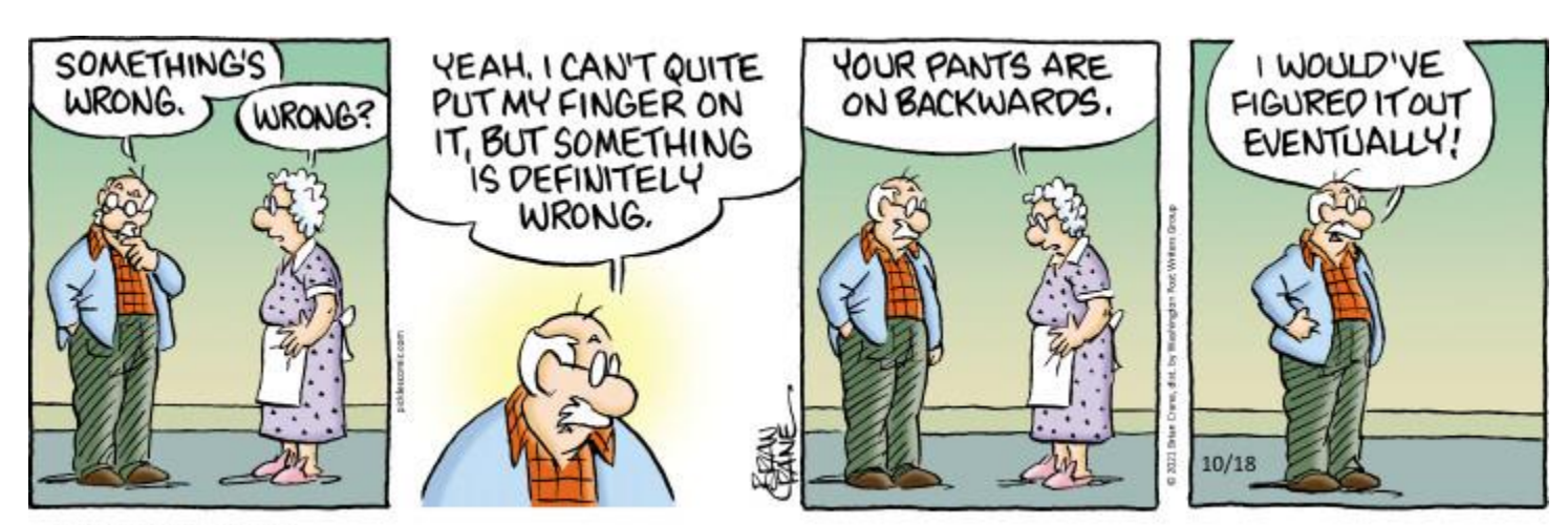
OBrian Crane. All rights reserved.

Pine Street door – Our main church door on Pine St. is not so easy to repair. We need to replace the existing opening mechanism and that is proving difficult to find replacement parts, due to the age of the equipment. We have a couple of contractors trying to find what we need. It is hoped that once the right equipment is found we can go ahead. Additionally, we are hoping to install remote palm buttons on the inside and outside of the door to make it more user friendly.