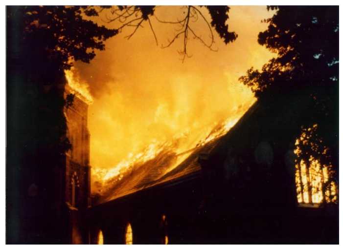
The fire of August 1979

In August of 1979, fire of an unknown origin started in the basement of the church in the early morning hours and quickly spread through the largely wooden structure and out through the walls and roof. By mid-morning, Grace United Church was a pile of ashes and rubble where the once stately stone structure had stood for 108 years.