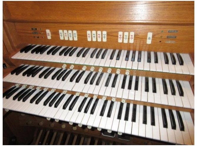
Pipe organs can last hundreds and even thousands of years. The oldest parts of our pipe organ were built in England in 1859 and are just as serviceable today as then. We applaud the foresight of our Trustees who, in the 1970s, ensured that we had adequate insurance to allow us not only to rebuild our beautiful church, but to be able to actually replace our pipe organ with an even finer instrument. We look forward to many, many years of service.

If purchased new, in 2022, the approximate value of the pipe organ in Grace United Church is $1.25 million dollars.