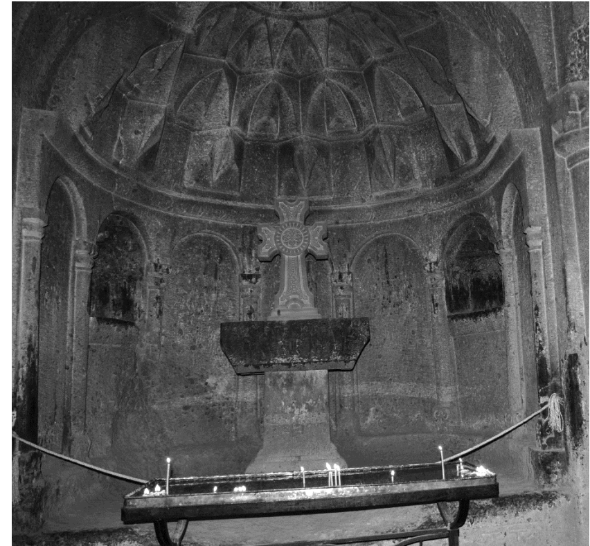
"The Church Inside the Rock" – (Geghard Monastery, Armenia)- Sep. 28, 2018

Where Everyone is Part of the Family & Worship is a Lifestyle NOT an Event