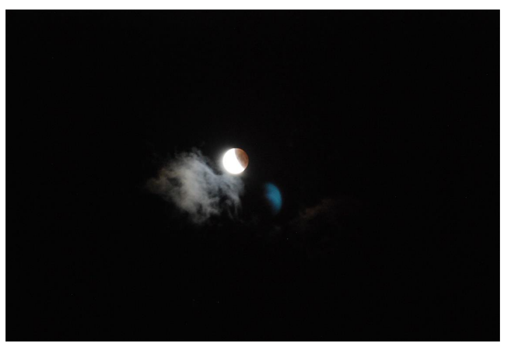
"Light in Darkness" – (Total Lunar Eclipse, Portland, ON)- Sep. 28, 2015