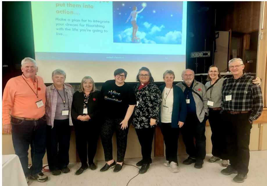
Flourishing Workshop Grace UC Participants (left to right)