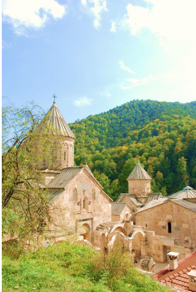
Hagharitsin Monastery, Armenia – September 26, 2018