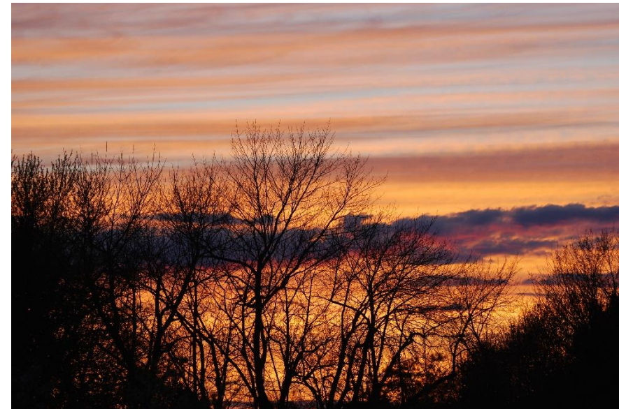
Rideau Lakes Township - May 9, 2021