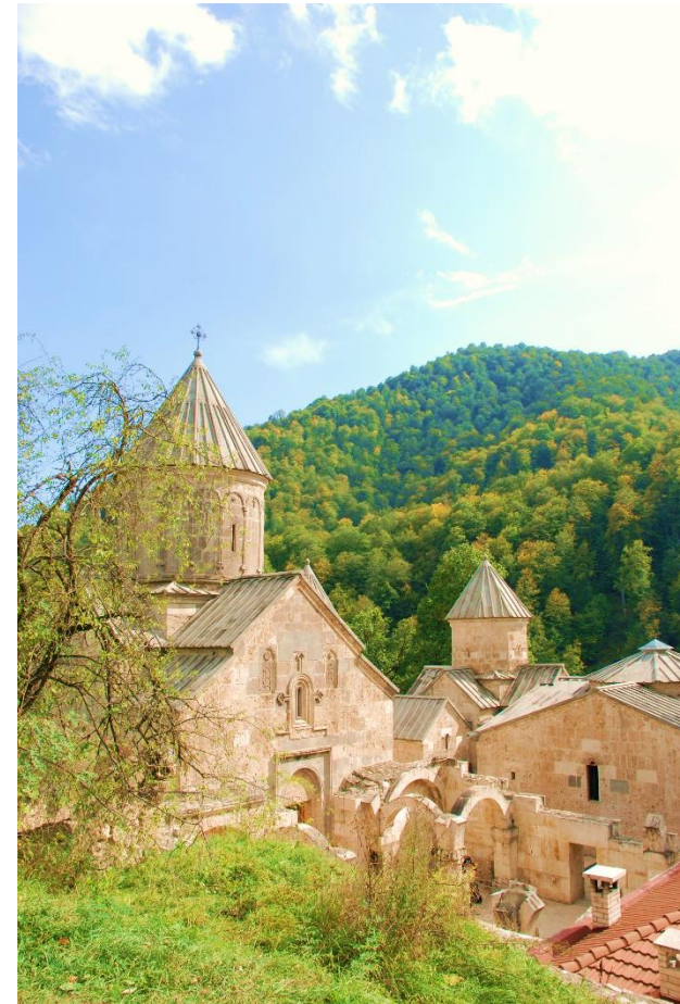
Haghartsin Monastery, Armenia - Photo by: Rev. Takouhi - September 26, 2018