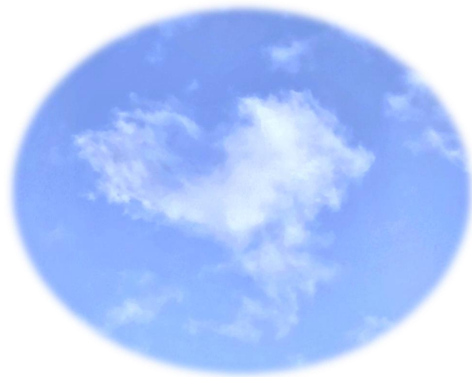
October 1, 2024 – God's Banner Over the entire World is Love... Portland, ON.

Service from the previous week will be shown on COGECO channel 13 or 700HD at 10:30 am Sunday mornings.